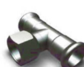
Adattatore Tee fil. femmina T-piece with female thread T-Stück mit I.G. Abgang