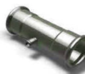
Tee ridotto T-piece reduced Red. T-Stück