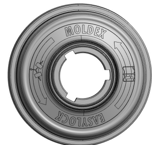
Backside 9030 with the new symbols "Replace filters in pairs" and "Read user information!"