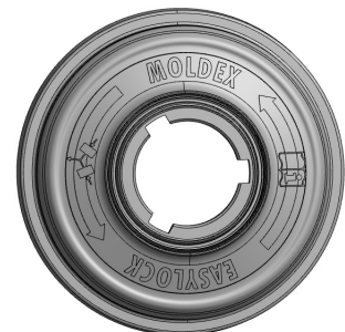
Backside 9030 with the new symbols "Replace filters in pairs" and "Read user information!"