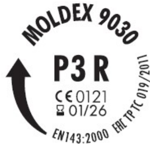
Front view 9030