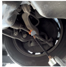
Release steering linkages