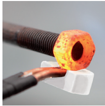
Release rusted bolts